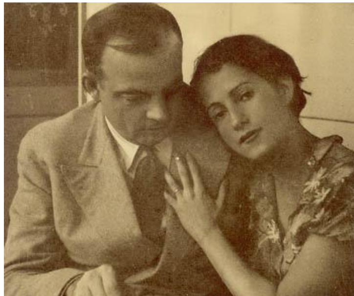
Antoine and Consuelo De Saint-Exupéry